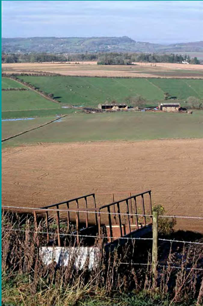
© Countryside Agency - Photographer Nick Smith 02-8008